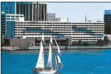
View of the Sheraton Waterside

It's right on the waterfront in downtown Norfolk, which has become quite an attractive area in recent years. Downtown's amenities include dozens of pretty mermaid sculptures, placed every block or two, often in park-like settings.