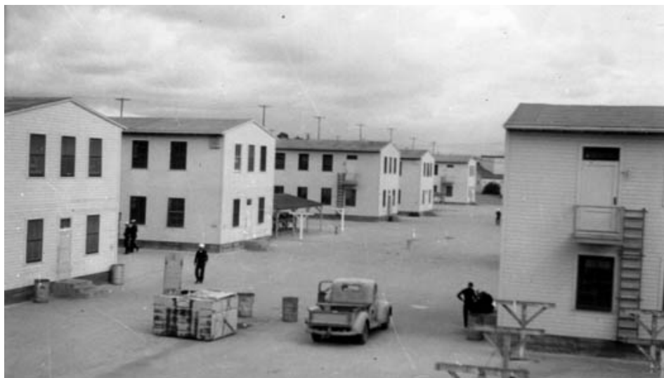
1952 – The crew lived here during the Rankin's recommissioning. Nice.