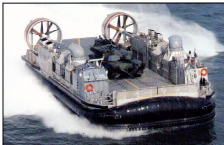
We want to ride on one of these!

On another front, we're working to find low-cost lodging for those who want to save on hotel costs. Our rates at the Sheraton are the lowest for any group, but we know that not everyone wants to pay them. If all you need is a safe place to sleep, we're trying to find one for you.