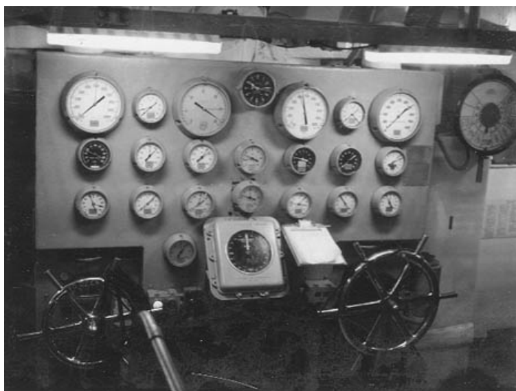
1963 – ENGINEERING MAIN CONTROL ROOM Engine orders from the bridge were carried out from here.